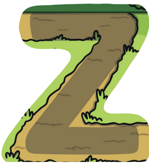
Zig, zag, path.