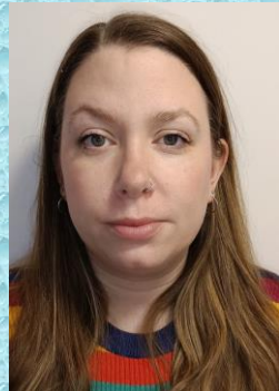
Miss Shotter Cover Weds PM